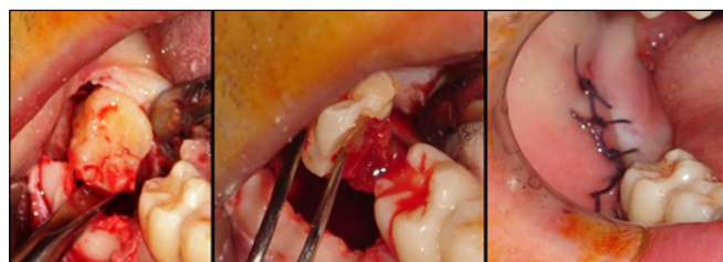
Figure 3. Surgical extraction of lower right third molar 48.

of the manifestations of this disease, in order to identify it earlier and to start with the proper follow-up of patients at risk.